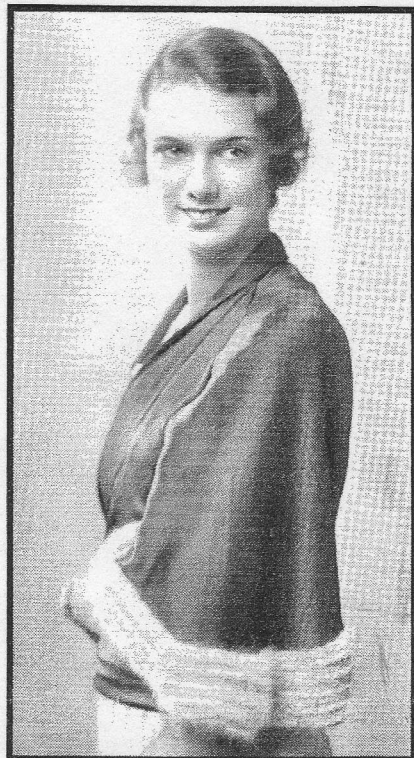
The loop trimming as it appears on a cape. Below you can see the rug which has been made by the same device